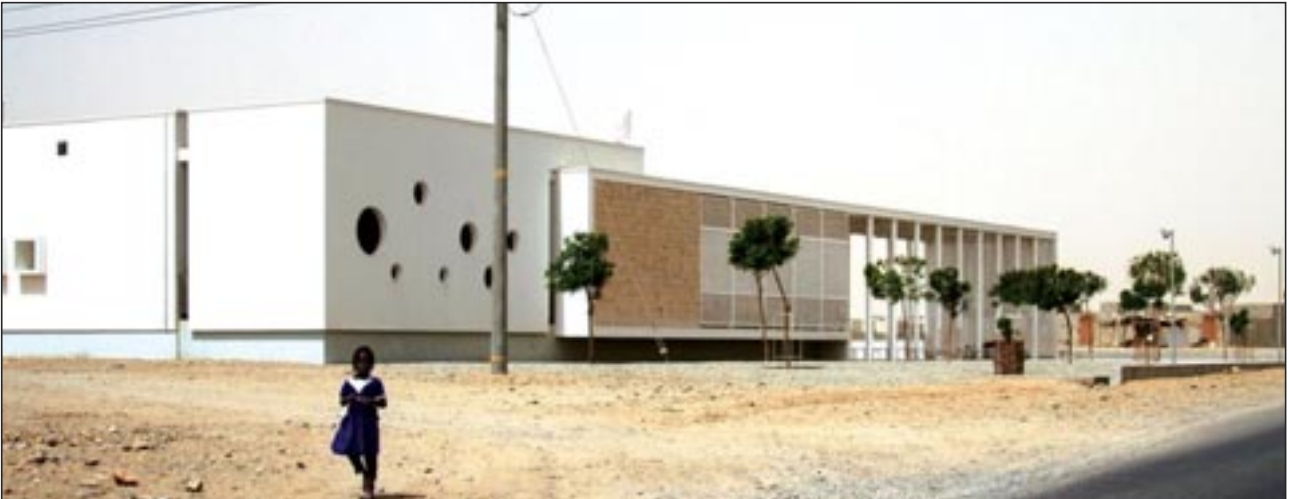
Port-Sudan emergency paediatric centre, Studio Tamassociati Architects, winners of the title Italian Architects of 2014